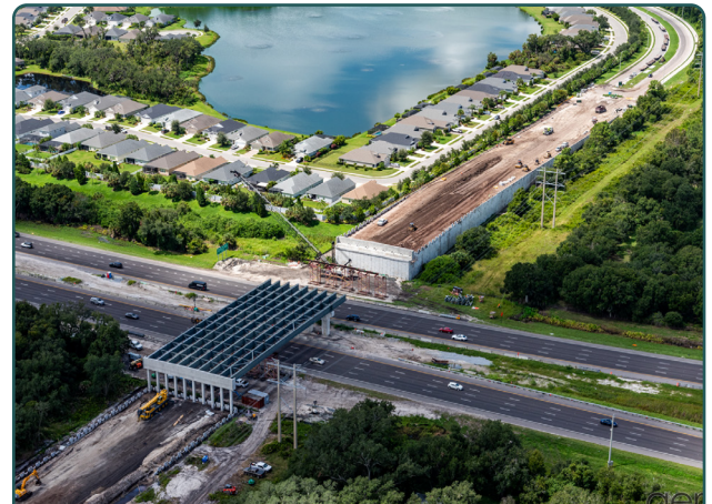
Southwest-facing view of bridge construction over I-75

Construction activities are active Monday through Friday, between the hours of 7 a.m. and 6 p.m. , with Saturday and nighttime work to be conducted on an as-needed basis. Travelers are asked to be mindful of construction equipment and materials being operated and staged in right-of-way areas.