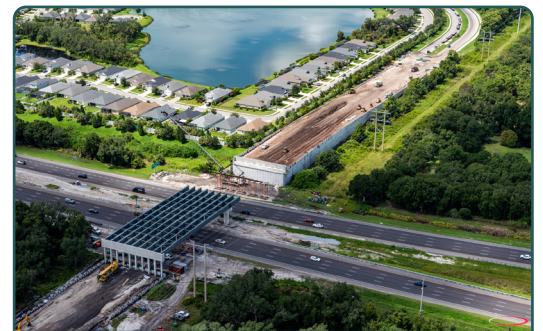
Steel bridge girders erected over the northbound lanes of I-75

East of I-75: Bridge construction activities in the County's reclaimed water storage lake, directly south of the Manatee County Wastewater Plant, are ongoing. Girder erection on the South Lake bridge is nearing completion and will be followed by bridge deck work continuing through the end of the year. Construction of an embankment and the retaining wall for the eastern end of the bridge over I-75 is continuing, to be followed by roadwork and lighting. Storm drainage and utility work are ongoing.